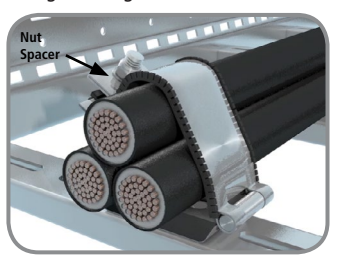
6. Using supplied mouthpiece fittings, tighten down to no more than 8Nm with 19mm nut spanner.

4. Tighten down to specified torque rating of 8Nm (2 bolt option pictured).