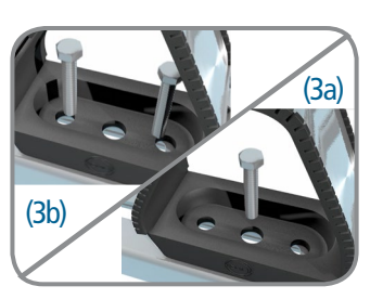
3. Secure cleat to the mounting surface using 1x M10 bolt (3a) or 2 x M10 bolts (3b), adding a washing and nut on both sides.

Note: Cleat marking can be found on hinged arm