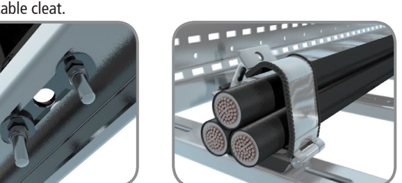
5. Place the cable into the cleat option and pull the hinged arm over the cables.

Note: Cleat marking can be found on hinged arm